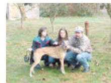
Eulogy in her first family photo