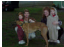
Aikman with the Simms Family