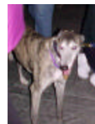
Ally after the Holiday Parade