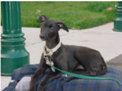
This is the First Meet 'N Greet for Taz. He caused quite a stir!

At greyhound Meet and Greets, I have been known to tell the story of when our oldest daughter found her life's sole mate, married, and left home taking our first greyhound with her. While we love our daughter dearly, we sure missed that dog!! So for us, could there be any other pet that would be better than owning a retired greyhound? We didn't think so. We've owned lots of cats and a terrier raised from a puppy. The terrier was nice, but nothing like a greyhound... Terrier puppy-hood was a challenge. So again, what could possible be better then a greyhound? We were about to find out.