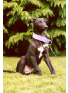
Taz in one of his first pictures.

"Do we really want a puppy?" we asked ourselves. But after seeing those cute puppy pictures on the Internet—well, maybe. We were told that we were "crazy" to even think about adopting a greyhound puppy. "Greyhound puppies are wild! They run all the time." We were told that a greyhound puppy would chew up our house. We were not getting much encouragement—and this was coming from our greyhound enthusiast friends!