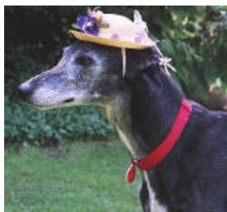
Miss Minnie is our taste tester

1/4 cup shortening 1/2 cup Peanut Butter 1/4 cup brown sugar 1 egg 1/2 cup wheat germ 3 Tbls. water 3/4 cup whole wheat flour 1/4 cup soy flour 1/2 cup powdered milk